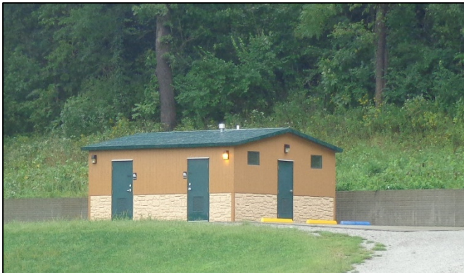
Shower house on the west side of Eveland Access Campgrounds.

In May of 2015, MCCB added a shower house to the west side of Eveland Access. The shower house features four individual restroom/shower stations. This is located on the hill just south of the campgrounds.