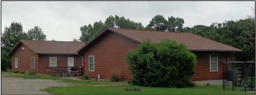
Modern cabins at Eveland Access.

Shortly after the cabins were built, MCCB started finalizing plans for a new campground west of the existing east side campgrounds. The two campgrounds are connected by an access road that runs underneath the highway bridge. This campground was built with larger campsites and camping pads to be able to accommodate the ever-increasing size of campers. Some of the sites were created to allow a camper to pull-through on the camping pad. They no longer had to back their campers into a spot. The west side of Eveland Access Campgrounds was opened to the public in 2011. Along with the new campground, MCCB added a dump station just south of the cabins.