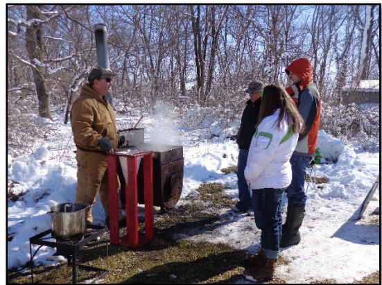
Evaporating sap at the 2013 Maple Syrup Festival.

The Sheets Addition truly has many things to offer. Whether you like camping at the campgrounds, lounging in a little more privacy in the cabins, exploring the surrounding woods for treasures, or enjoying an educational trip back in time by learning about maple syrup, this area is truly a gem.