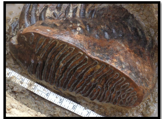
A Woolly mammoth tooth discovered in rural Mahaska County. It is now on display at the Environmental Learning Center.

In 2010, a femur bone from a Woolly mammoth that once roamed the land in Mahaska County during the last ice age was discovered by a landowner in rural Mahaska County. Afterwards, the Mahaska County Conservation Board had the privilege to help dig up the bones. Today, these bones are on display inside the Environmental Learning Center. They are fascinating to see and have been a great asset in teaching the public about our ice age history.