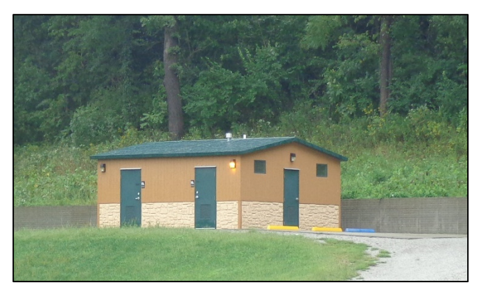
Shower house on the west side of Eveland Access Campgrounds.

accommodate the ever-increasing size of campers. Some of the sites were created to allow a camper to pull-through on the camping pad. They no longer had to back their campers into a spot. The west side of Eveland Access Campgrounds was opened to the public in 2011. Along with the new campground, MCCB added a dump station just south of the cabins.