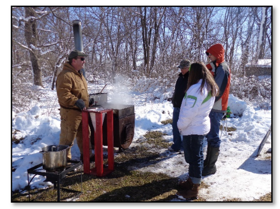
Evaporating sap at the 2013 Maple Syrup Festival.

The Sheets Addition truly has many things to offer. Whether you like camping at the campgrounds, lounging in a little more privacy in the cabins, exploring the surrounding woods for treasures, or enjoying an educational trip back in time by learning about maple syrup, this area is truly a gem.