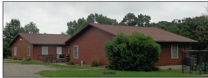
Modern cabins at Eveland Access.

Shortly after the cabins were built, MCCB started finalizing plans for a new campground west of the existing east side campgrounds. The two campgrounds are connected by an access road that runs underneath the highway bridge. This campground was built with larger campsites and camping pads to be able to