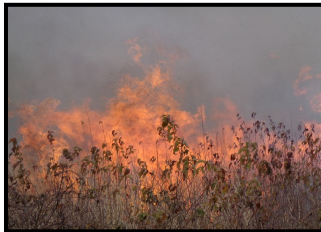
A prescribed burn by the Mahaska County Conservation Board..

Prescribed burns serve many purposes. Some of those purposes include: controlling undesirable vegetation; preparing sites for harvesting, planting or seeding; controlling plant disease; reducing wildfire hazards; improving wildlife habitat; improving plant production quantity and/or quality; removing debris; enhancing seed production; facilitating the distribution of grazing and browsing animals; restoring and maintaining ecological sites and managing native plant diversity/composition. With so many benefits, it is no wonder people burn. Just remember burns are unpredictable so they should follow specific guidelines with the appropriate safety precautions.