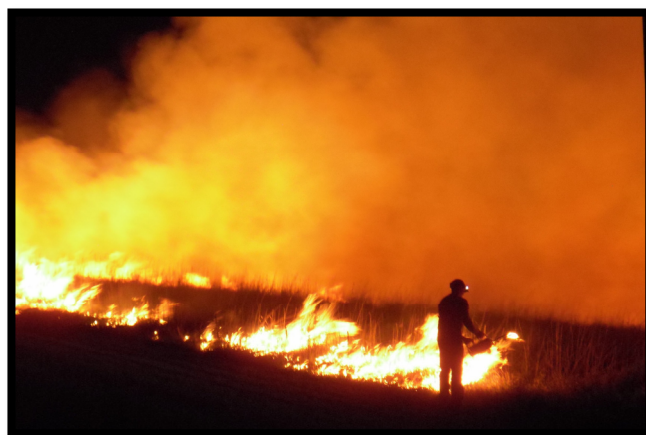
Prescribed burning by the Mahaska CCB and Mahaska County Pheasants Forever during a night burn.

According to the Environmental Encyclopedia , deliberate burning is an age-old method of maintaining